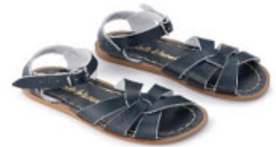
SUMMER BUCKLE SANDALS