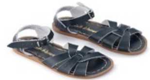
SUMMER BUCKLE SANDALS